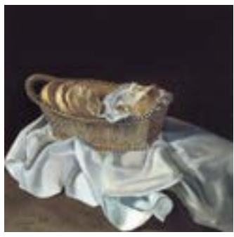
Salvador Dalí The Basket of Bread (1926), 12 1/2 in x 12 1/2 in