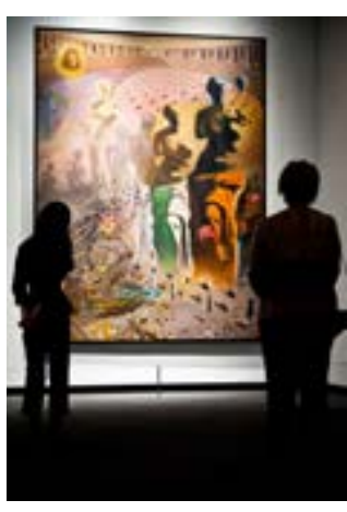
The Hallucinogenic Toreador, 1969-70, Oil on canvas. ©Salvador Dalí. Fundació Gala-Salvador Dalí, (Artists Rights Society), 2021 / Collection of the Salvador Dalí Museum, Inc., St. Petersburg, FL, 2022.