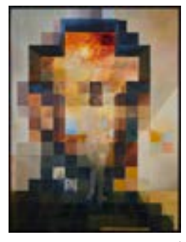
Salvador Dalí Gala Contemplating the Mediterranean Sea which at Twenty Meters Becomes the Portrait of Abraham Lincoln-Homage to Rothko (1976), 99 1/4 in x 75 1/2 in,