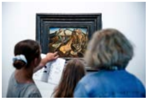
Daddy Longlegs of the Evening–Hopel, 1940, Oil on canvas. ©Salvador Dalí. Fundació Gala-Salvador Dalí, (Artists Rights Society), 2021 / Collection of the Salvador Dalí Museum, Inc., St. Petersburg, FL, 2022.