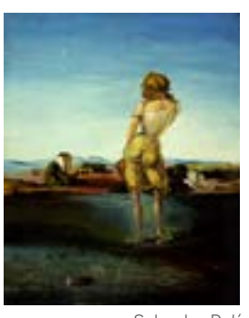
Salvador Dalí Girl with Curls (1926), 20 in x 15 3/4 in