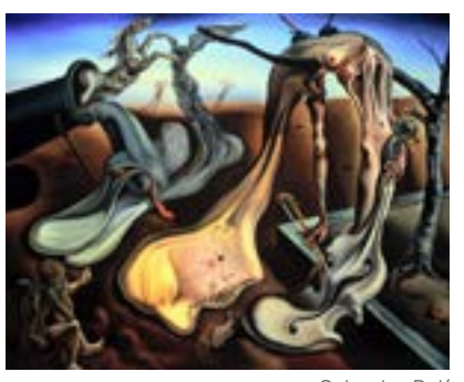
Salvador Dalí Daddy Longlegs of the Evening-Hope! (1940), 16 in x 20 in