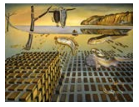
Salvador Dalí The Disintegration of the Persistence of Memory (1952-54), 10 in x 13 in