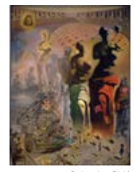
Salvador Dalí The Hallucinogenic Toreador (1969-70), 157 in x 118 in