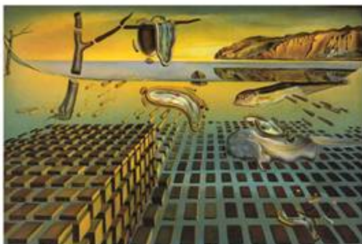
The Disintegration of the Persistence of Memory 1952-54 Oil on Canvas

Salvador Dalí was famous for painting repeated images of melting clocks. He produced two paintings twenty years apart. Both were very similar but the second one, painted in 1952-54 reflected the scientific theories of his era including Werner Karl Heisenberg's theories of quantum physics and Albert Einstein's theories of space and relativity. Dalí transformed the foreground of his second work into pixilated floating atomic particles. Since time was constantly changing Salvador Dalí felt it was uncontrollable. Use this activity to make a Dalí style clock. Rearrange the hands to learn more about time.