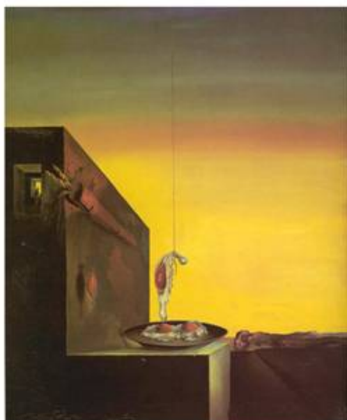
Oeufs sur le Plat sans le Plat, Oil 1932