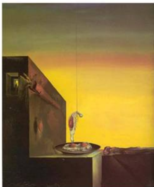
Oeufs sur le Plat sans le Plat, Oil 1932